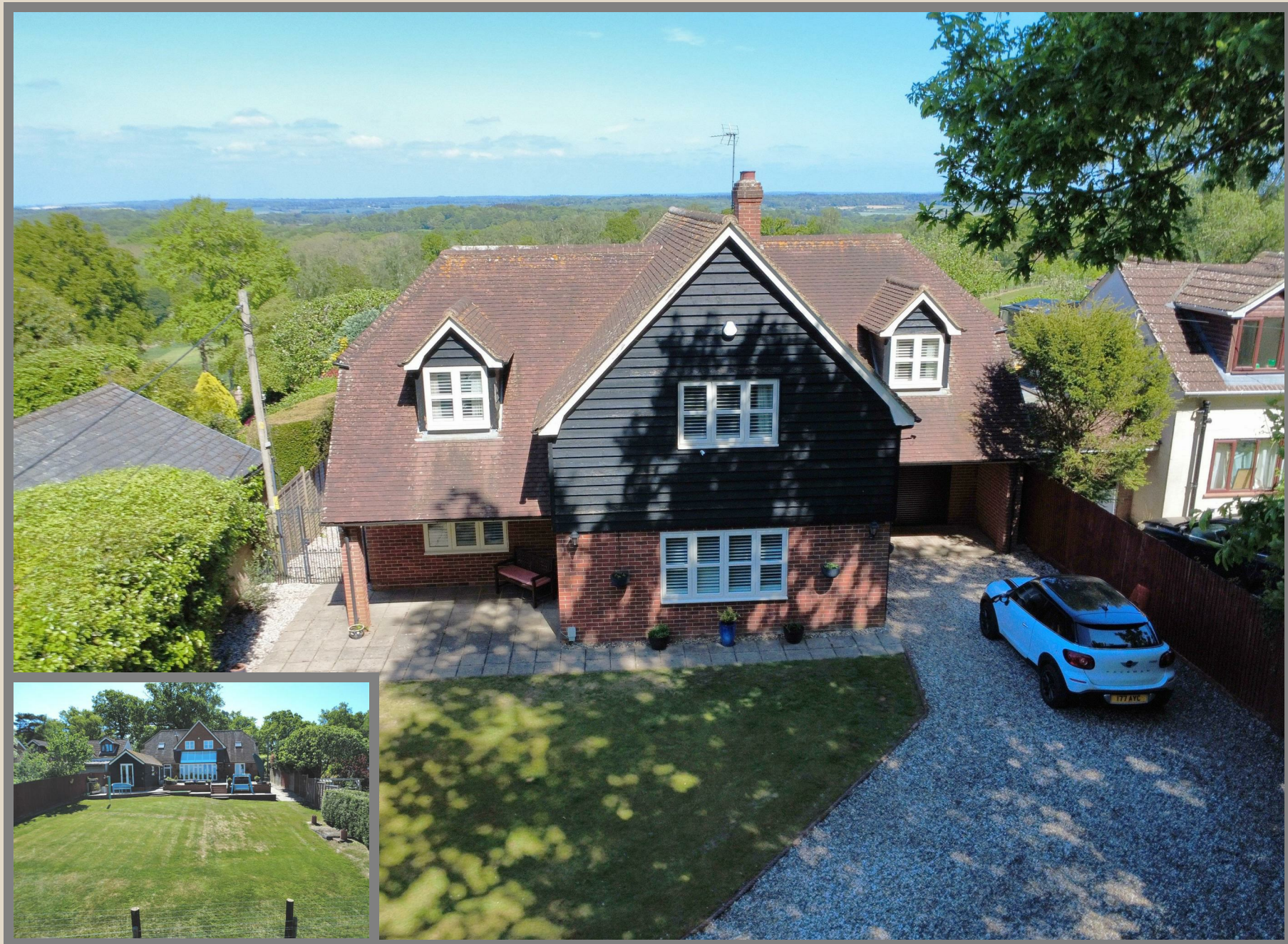
Oak House, The Ridge, Cold Ash, RG18 9HX